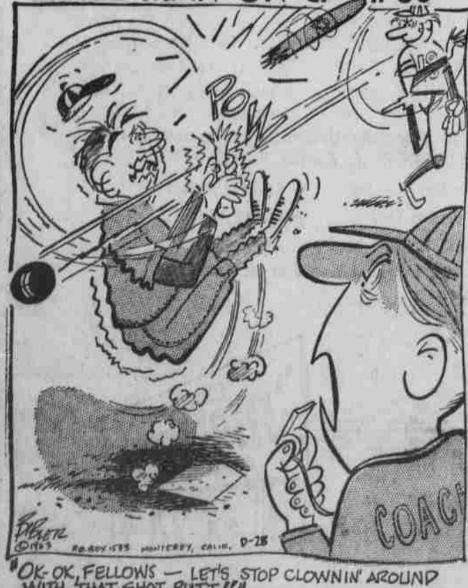
OK-OK, FELLOWS — LET'S STOP CLOWNIN' AROUND WITH THAT SHOT PUT!!