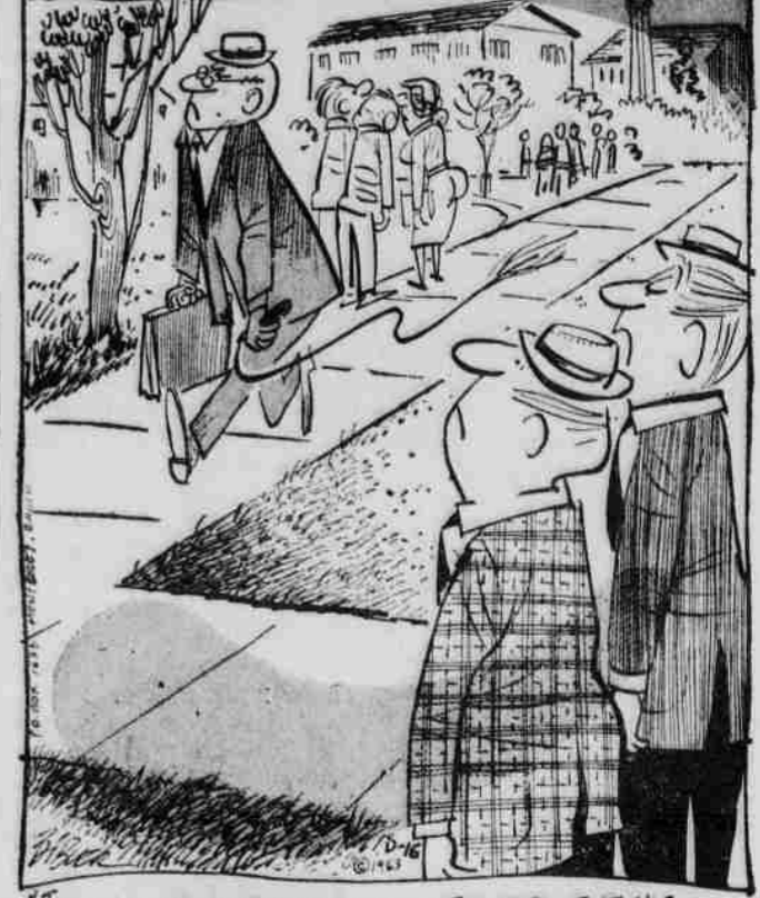
"I DON'T KNOW HOW HE IS AS A LECTURER, BUT HIS STUDENTS SEEM TO RESPECT WHAT HE HAS TO SAY."