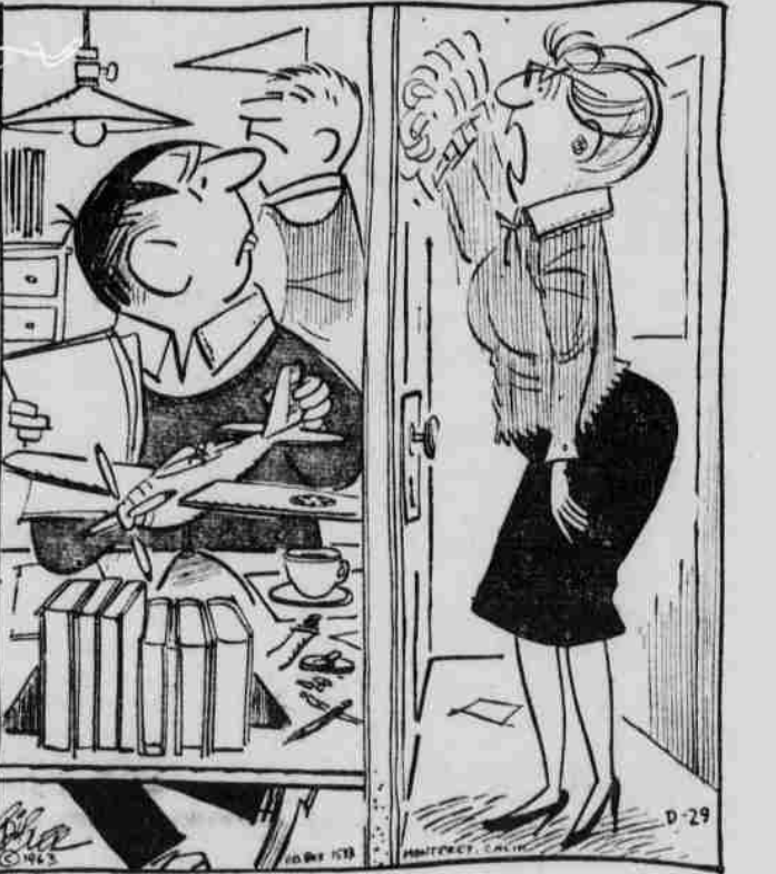
"YOU MAY AS WELL OPEN UP—I OVERHEARD ONE OF THE BOYS DOWNSTAIRS SAY YOU HAD A BEAUTIFUL MODEL LIP IN YOUR ROOM!"