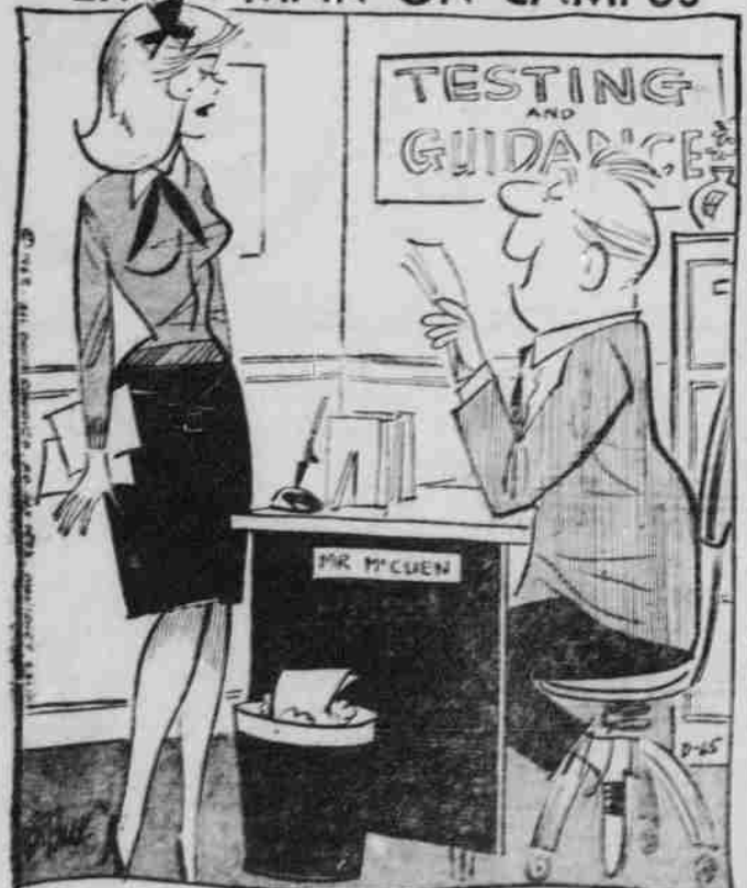
"Well, to start on a brighter note, Miss Collins, you certainly did pass your student physical."