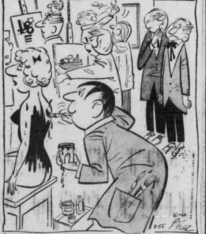
POOR IN SCULPTURE, CRAFTS, AND DRAWING—HIS ONLY REAL TALENT SEEMS TO LIE IN PAINTING NUDES.