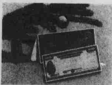
Ask to have your gift Bonds in the special presentation envelope. No charge.

If you have any questions about U. S. Savings Bonds for investment, income or gifts, your bank or other issuing agent will be glad to help you.