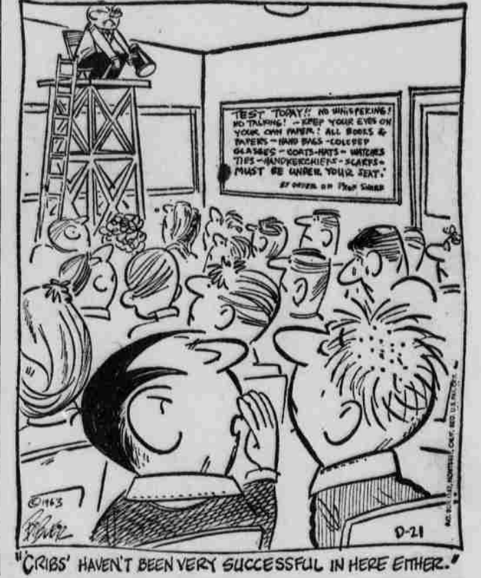
"CRIBS" HAVEN'T BEEN VERY SUCCESSFUL IN HERE EITHER."