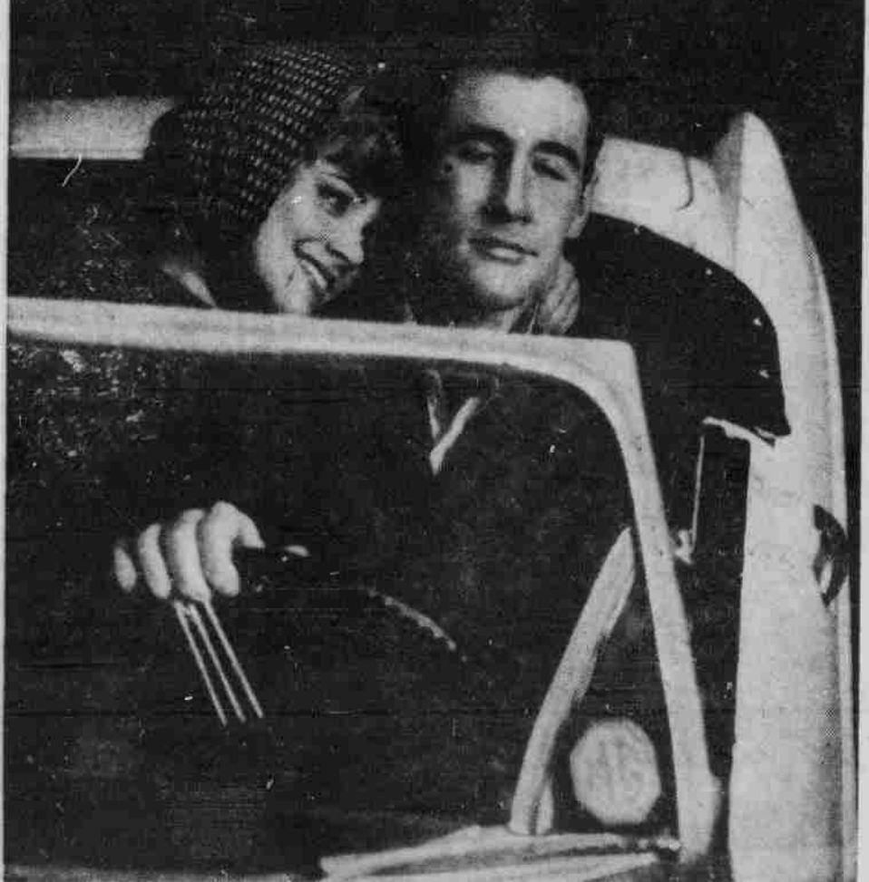
Does a man really take unfair advantage of women when he uses Mennen Skin Bracer?