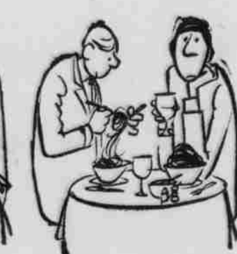
1 2. Worried about exams, huh? No, about getting old.