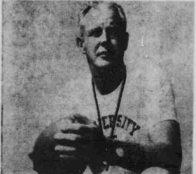
SOONER COACH—Oklahoma Coach Bud Wilkinson waits for crucial games with Missouri and Nebraska after two Big Eight wins.