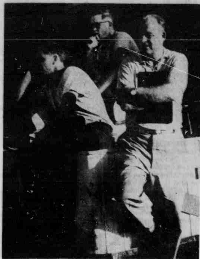
TOP-LEVEL SCRUTINY—Head Coach Bob Devaney oversees from the sidelines Wednesday at the Husker camp.