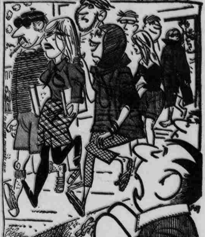
"NO, I'M NOT INTERESTED IN THEATRE WORK—I JUST LIKE TO SIT OVER HERE AND WATCH THE DRAMA CLASSES DISMISS."