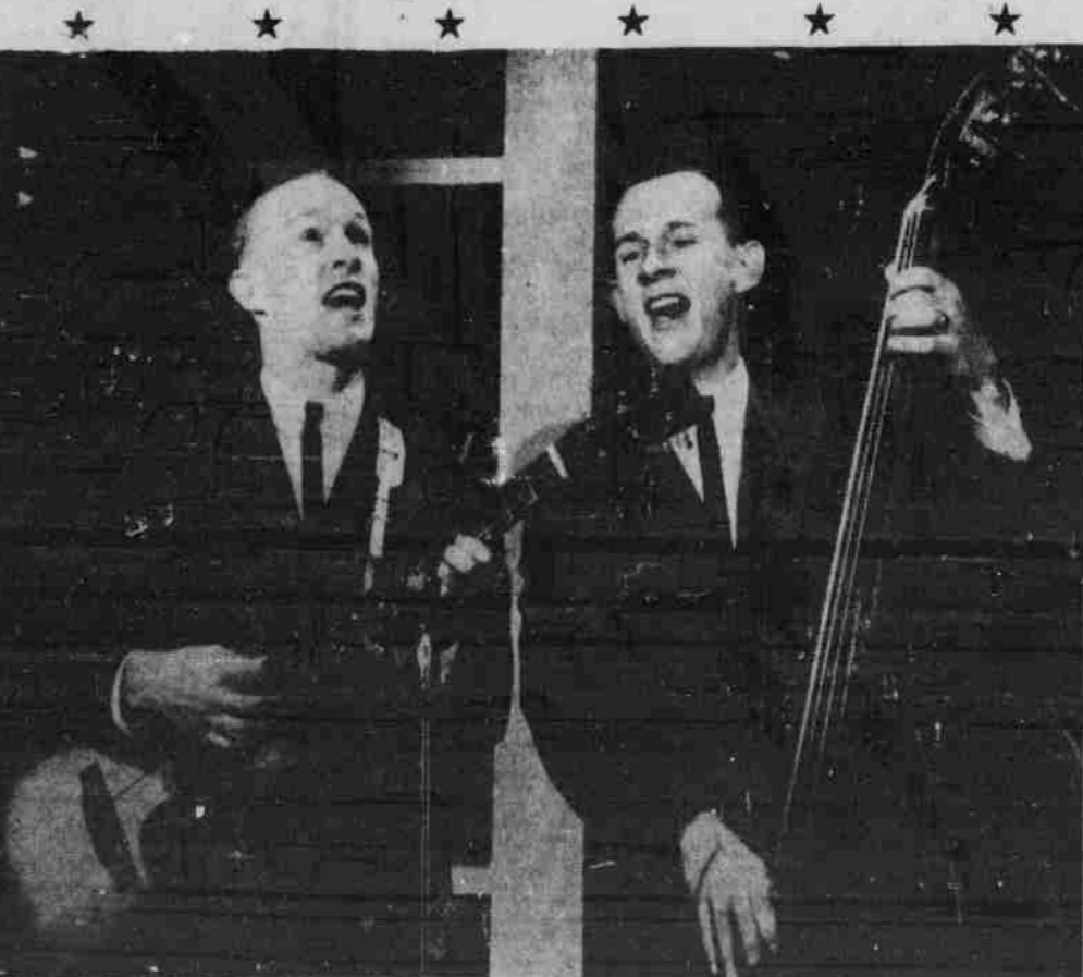
SMOTHERS BROTHERS—This pair of 'commercialized folk song dismantlers' will play a two-show performance at the Student Union, May 15, at 7 and 9 p.m. Tickets for the show will be $1.75 for general admission and $2 for reserved seats and will go on sale one week before the show date.

The Smothers Brothers, gleeful dismantlers of commercialized folk music, will play a two show performance at 7 and 9 p.m. at the Student Union, May 15.