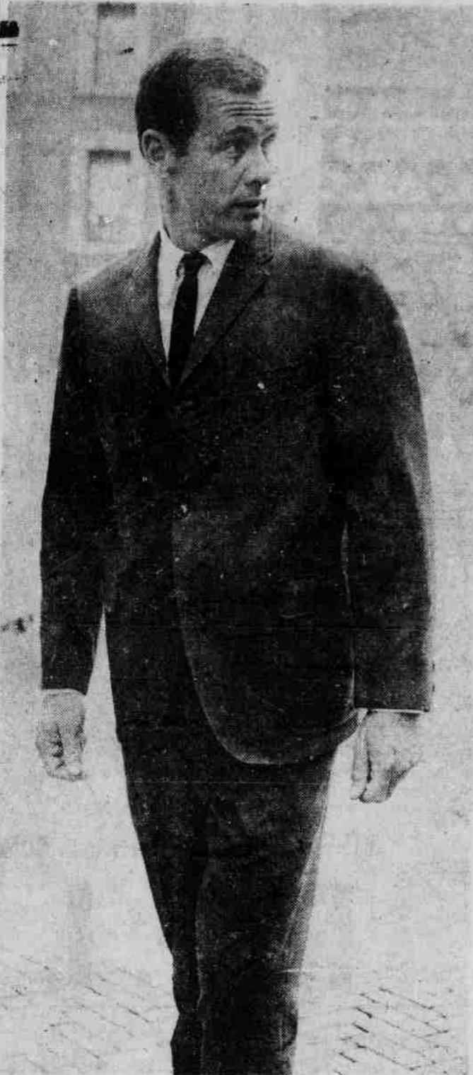
COUNTRY AIR — Blue work denim goes to the office, as illustrated by this smartly tailored sports jacket with matching pants. Remove the tie and change the shirt and the combo becomes ideal for a casual weekend in the country. Jacket and pants are lined with cotton flannel. See page five.

PRESIDENT KENNEDY approved a new policy recognizing global status for one U.S. airline — Pan American — and proposing to restrict other U.S. airline activities abroad to specific world areas. The policy calls for greater U.S. authority over international air fare violations and for a sterner attitude toward fare agreements with the airlines of other nations.