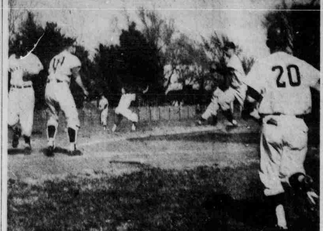
HUSKERS SCORE-A Husker crosses the plate as Nebraska pushes three runs across in The Husker infield turned in the first game of the twin bill played against Kansas State.

shown some good defensive the visitors picked up three play thus far in a budding more runs. scason, were clumsy as they made 7 errors while the Wild- in every inning but the third cats pounded the first two NU but could not keep the prolast two Husker hurlers, Jim were left on base in five in-