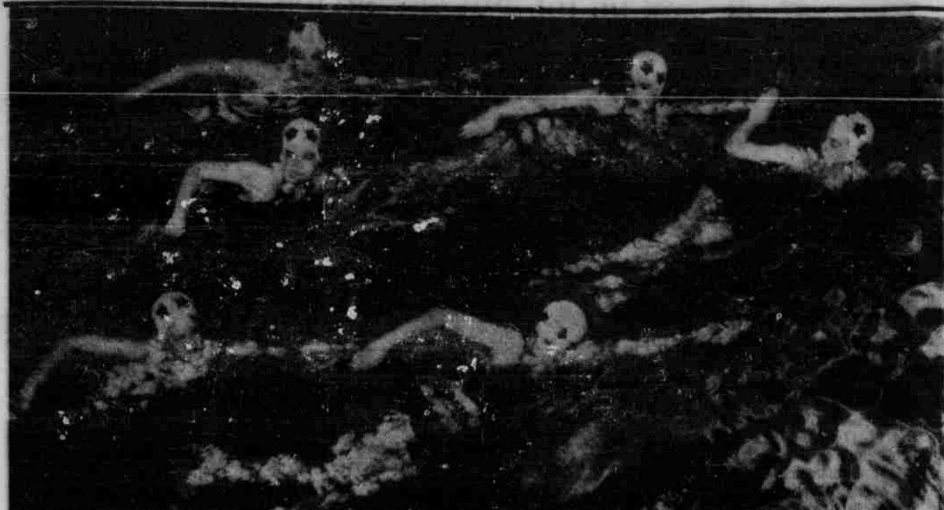
AGE OF REVOLUTION—Six members of Aquaquettes depict how the red, white and blue was established. The theme of the water show was "Down Through The Ages."