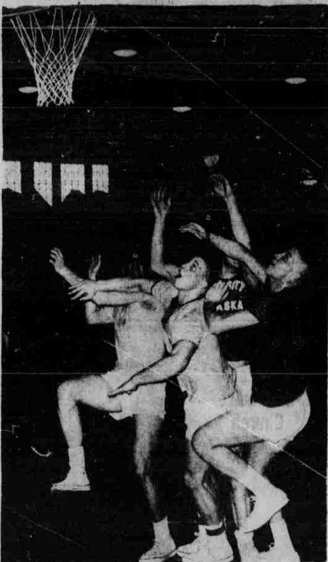
IM TOURNEY FINALS—The All-University intramural basketball finals are entering the last days of action. Today the Sig Alphas meet Avery I, Burr-Selleck champion, at 4:45 p.m. The championships will be determined on Saturday afternoon between games of the State Basketball tourney.

Score by quarters: Sigma Phi Epsilon-C . . . 12 6 11 19-50 Beta Theta Pi-C . . . 10 13 11 6-49