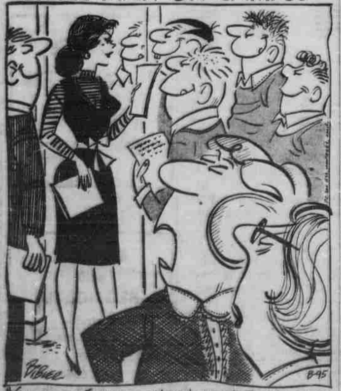
SOMETIMES I SUSPECT MISS LAMONT'S FRENCH CLASS MAY FALL INTO THE CATEGORY OF ENTERTAINMENT.