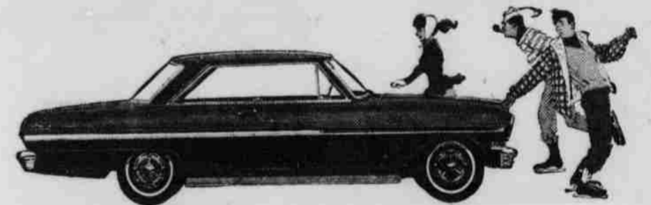
CHEVY II NOVA 400 SPORT COUPE