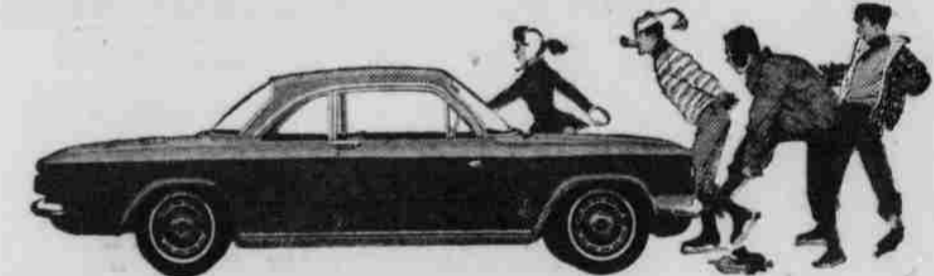
CORVAIR MONZA CLUB COUPE