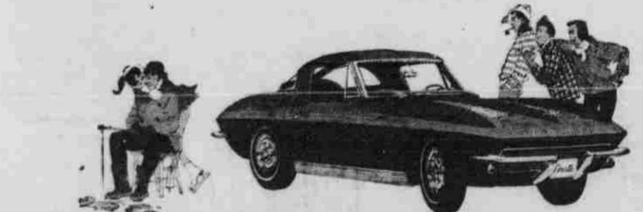
CORVETTE STING RAY SPORT COUPE

Now—Bonanza Buys on four entirely different kinds of cars at your Chevrolet dealer's