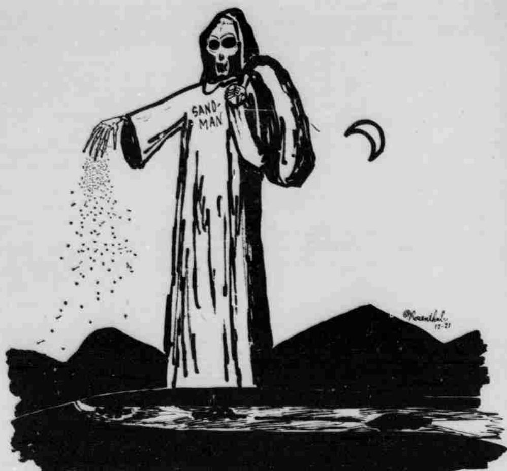
"GOOD NIGHT, SLEEPYHEADS... SAY YOUR PRAYERS!"