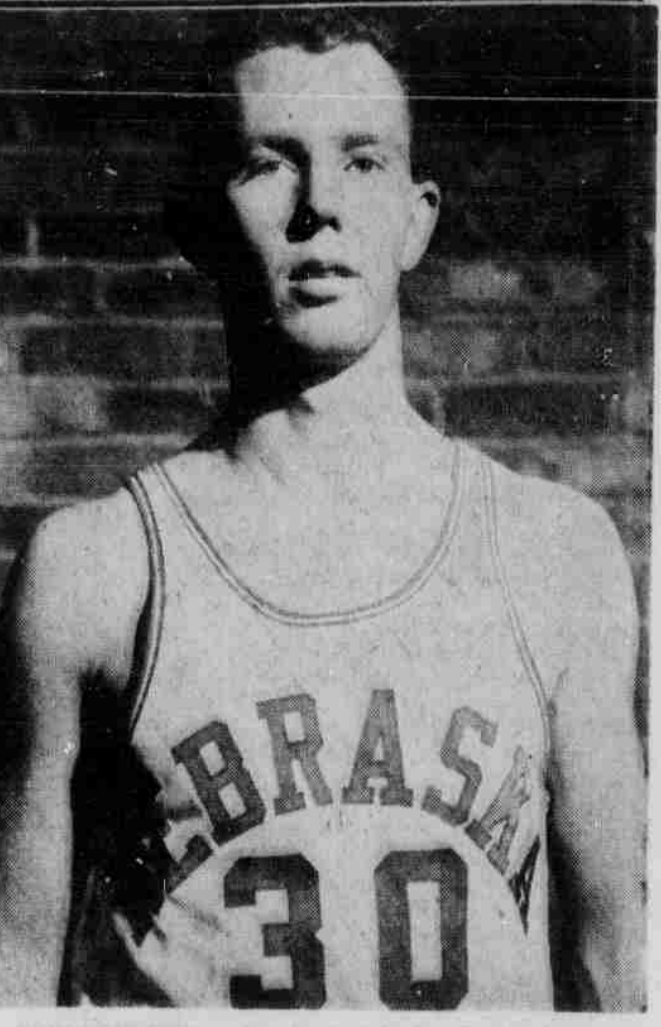
BORN SCHLEGL — has best night for Cornhuskers.