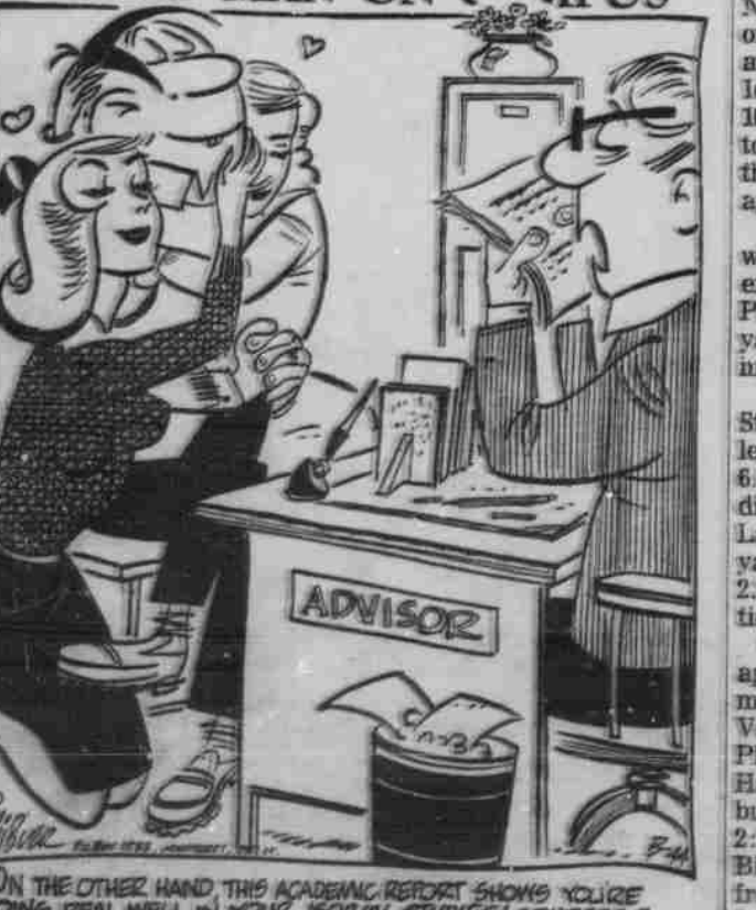
ON THE OTHER HAND, THE ACADEMIC REPORT SHOWS YOU'RE DOING REAL WELL IN YOUR "SOCIAL STUDIES" COURSES.