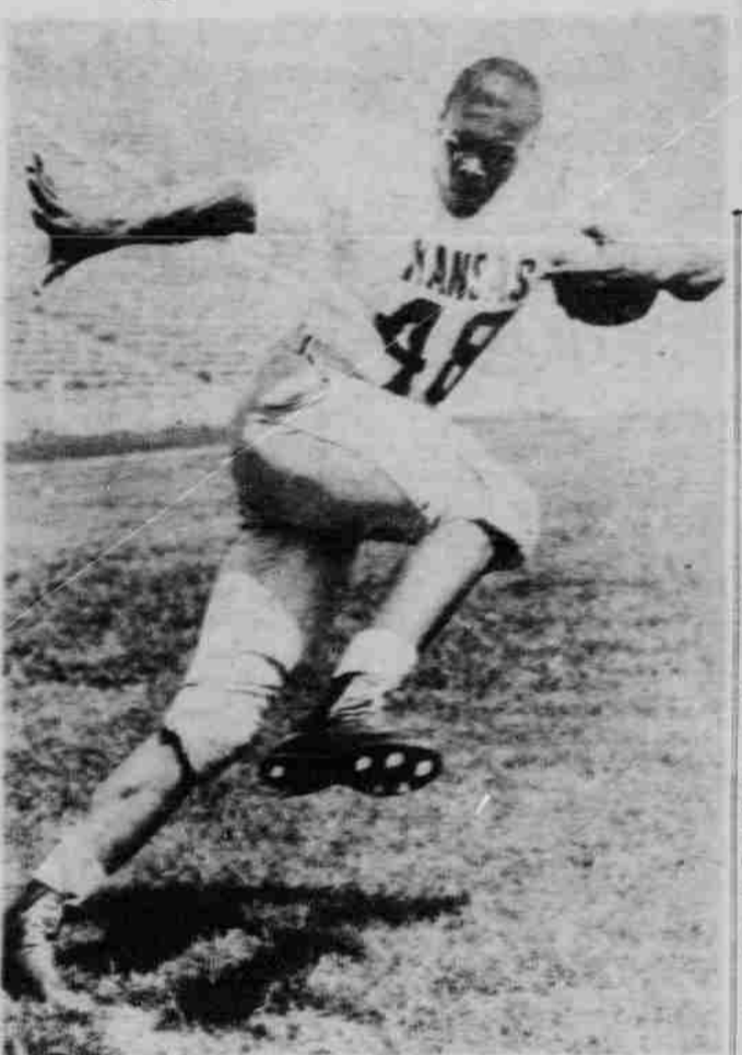
GALE SAYERS—Kansas star