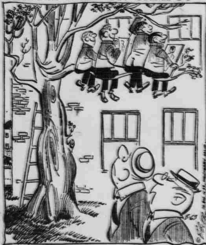
THANK GOODNESS WE'LL HAVE MORE CLASSROOM SEATING WHEN THE NEW ART BUILDING IS FINISHED.