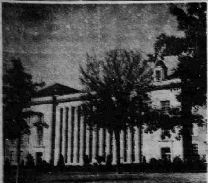
LOVE MEMORIAL LIBRARY—A familiar place to all Nebraska students, Love Memorial Library opened its doors today to undergraduates, graduates and faculty. The library is a study center for many students before classes, after classes, between classes and evenings.

Joslyn Art Museum of Omaha has announced a $100 Chamber of Music Award for original composition for string quartets. Competition is open to any composer or student of composition who has permanent residence or attends school in Nebraska, Iowa, South Dakota, Kansas, Missouri, Oklahoma, Wyoming, Colorado, North Dakota or Minnesota. Entries will be judged by members of the Fine Arts Ensemble.