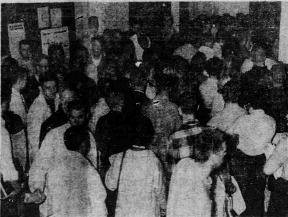
WE HAVE RETURNED—With the ringing of the 8:00 a.m. bell comes the familiar before-class "people jam."