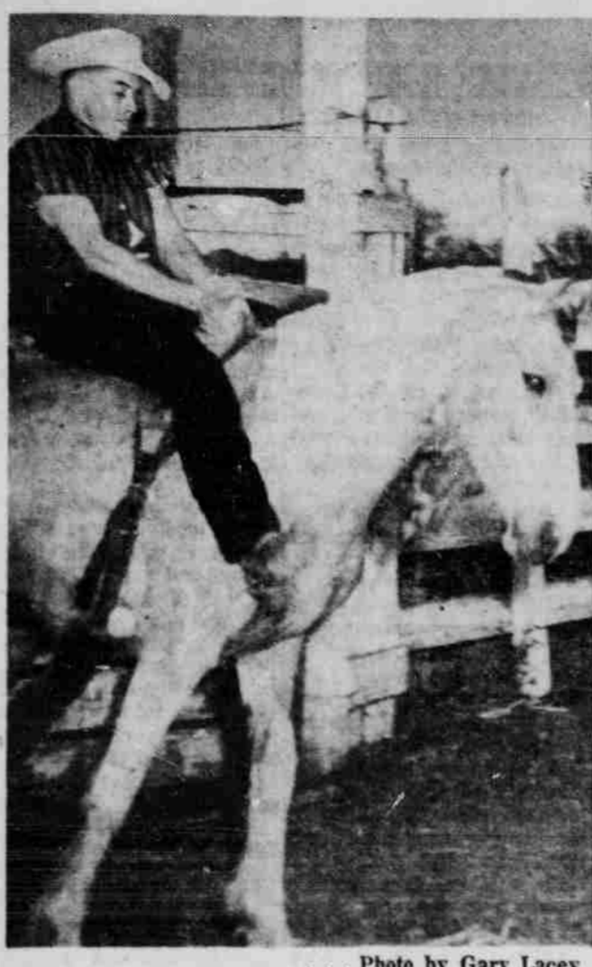
RIDE 'EM COWBOY—That's the cry as this Rodeo Club bursts out of the corral in a practice session. The NU Rodeo will be held at the Fairgrounds and Ag Campus this weekend.