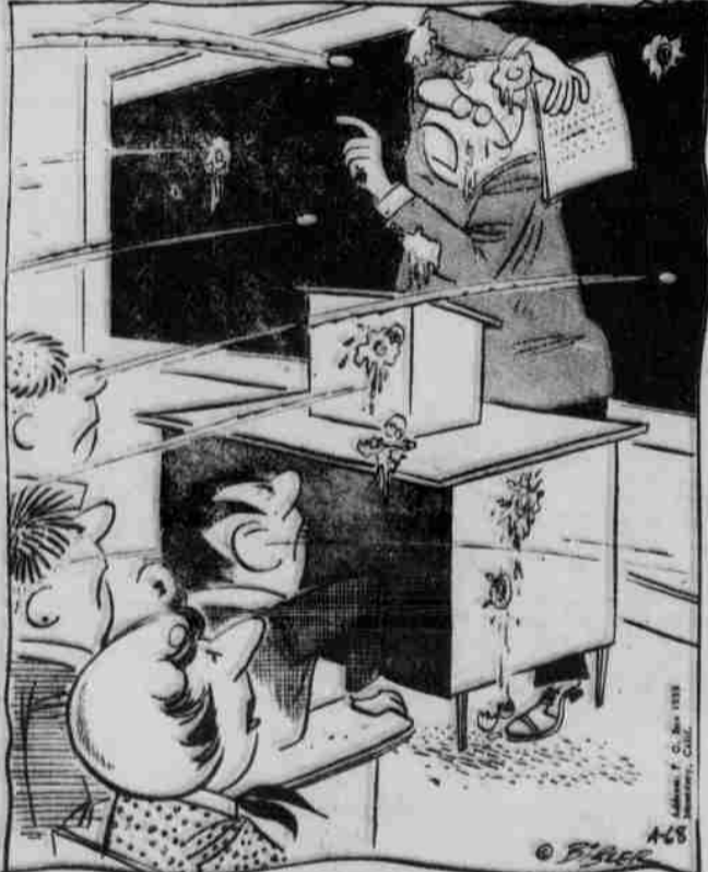
"IF YOU'LL THINK BACK A FEW LECTURES—I SAID YOU'D GET YOUR CHANCE TO EVALUATE THIS COURSE AT THE END OF THE TERM!"