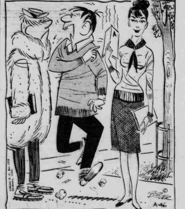
"JUST AS I THOUGHT COONSKIN SNARF DOESN'T READ 'EM!! LOUISE TURNED IN ED'S 'F' PAPER WITH PERFUME ALL OVER IT."

it's easy as P.V.P. to recognize true diamond value