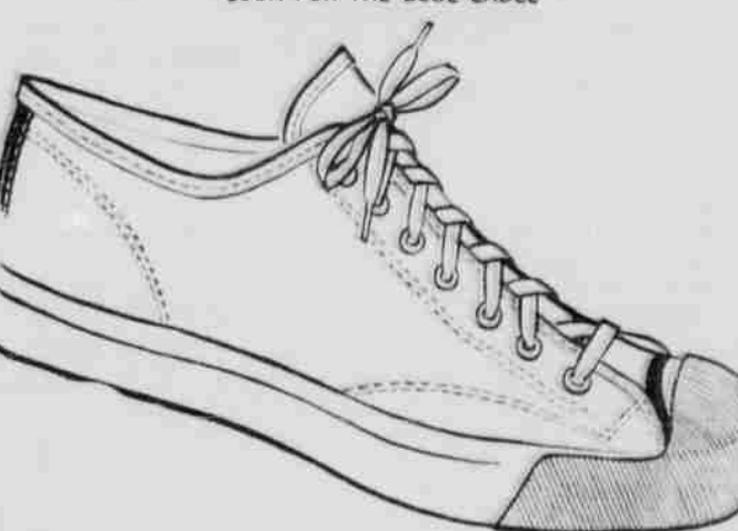
YOU TELL HER, MAN. The Court King is your shoe ... professional-traction-tread voles, flexible instep, full cushioning. A pro on the tennis court, but just as right with stacks.