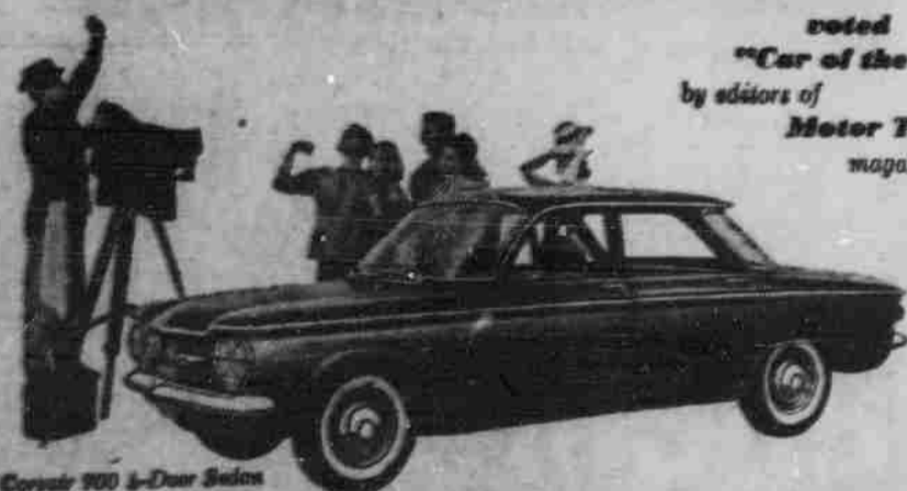
Corvair 4-Door Sedan

B... miles wringing extra miles from every gallon, and besides stacking up as 1960's outstanding car—look what else Corvair has in store for you. The smooth-as-butter ride you get from independent suspension at all four wheels. The increased traction that comes with the engine's weight over the rear wheels—where it should be in a compact car. A practically flat floor, a folding rear seat, five jaunty models, including the new Monza Club Coupe.