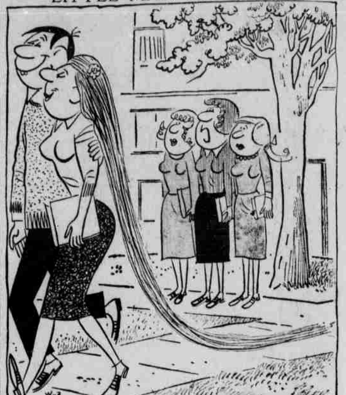
"KEPUNZEL WON'T TELL HOW SHE DOES IT, BUT SHE MANAGES TO SNEAK SOME BOY UP INTO HER ROOM ALMOST EVERY NITE."