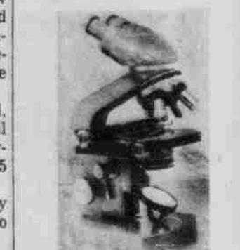
Pictured model is Elgeet-Olympus EC81

Elgeet of Rochester PRESCRIBES HIGH QUALITY MICROSCOPES AT LOW PRICES!