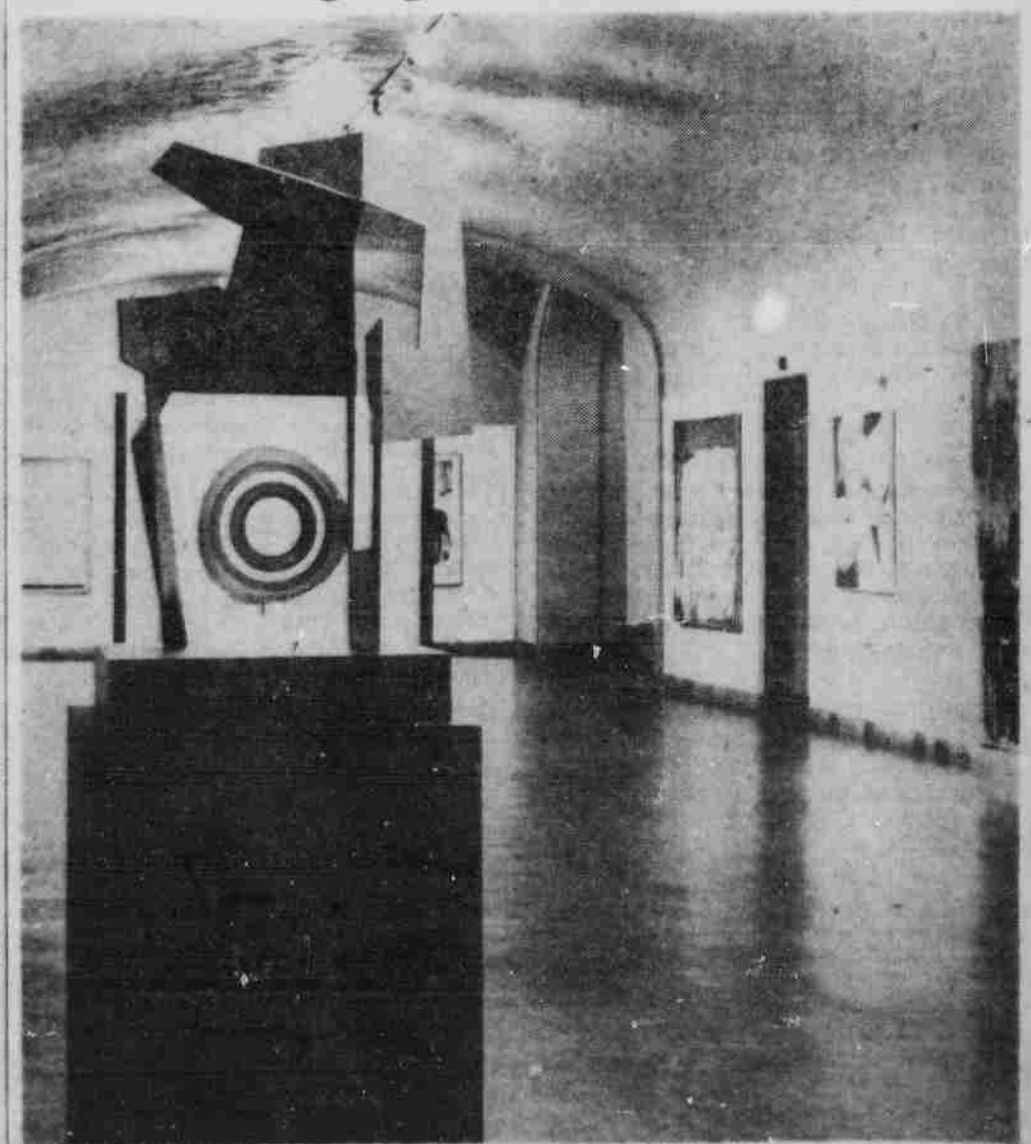
WHAT IS IT?—Shooting gallery? No, it's only one of the exhibits in the new art gallery at Morrill Hall. The foreground figure on the pedestal is made of sheet steel, titled "Slow Forms Before Closing Space" by creator Jorge Oteiza. What

seems to be a target is an oil painting called "Song," at the other end of the gallery. The exposition opened Monday on the second floor of Morrill Hall. There is no admission.