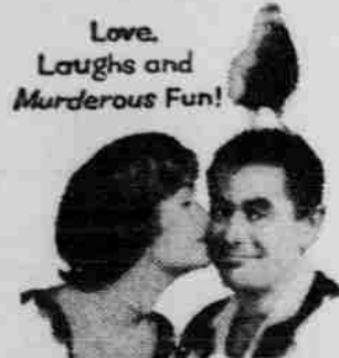
M-G-M presents GLENN FORD / DEBBIE REYNOLDS