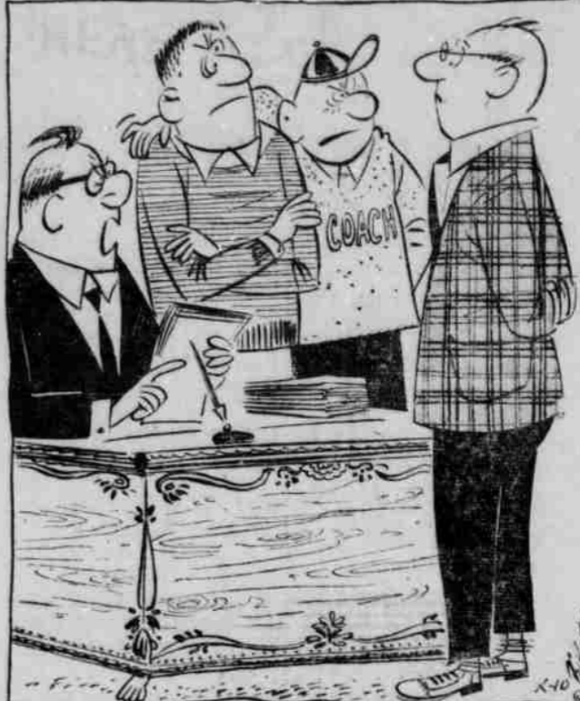
YOU'RE CHARGED WITH FRUSTRATING YOUR STUDENTS BY YOUR CONSTANT CLASSROOM REFERENCES TO 'THE DAY OF RECKONING' AFTER FOOTBALL SEASON.