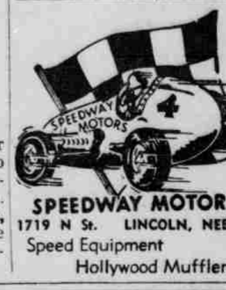
SPEEDWAY MOTORS 1719 N St. LINCOLN, NEBR. Speed Equipment Hollywood Mufflers

The Israel-Western Europe tour is designed to give the student a view of the countries and an opportunity to live with the people. The $1310 fee includes round-trip steamship passage, all meals, hotel accommodations, sight-seeing, excursions, museum fees and some theatre tickets. Three departure dates from New York are scheduled during June.