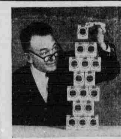
Dr. Frood, Ph.T.T.

Dear Put Upon: Cover yourself and stay indoors.