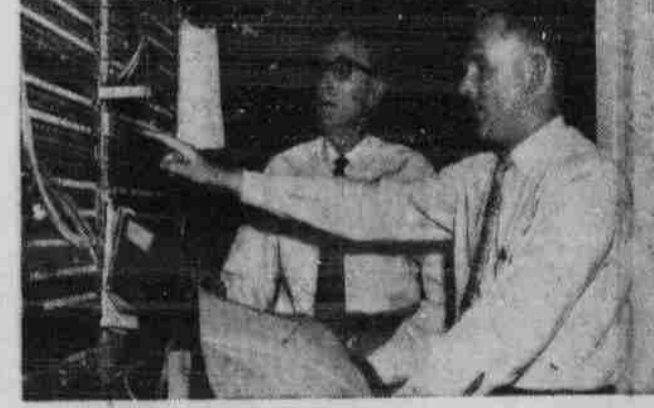
"3:00 p.m. At our toll center we'll soon be adding another test desk to increase our facilities for 'trouble shooting' Long Distance circuits. Here, with our Chief Testboardman, I go over some of the board changes which will have to be made."

"That's about it for one day. Tomorrow's schedule will be different. I'm doing interesting, challenging work all the time—and I'm given plenty of responsibility. That's what I like about my job."