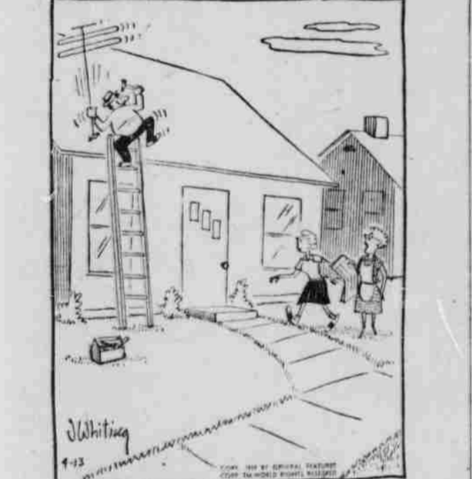
"I'll find a TV mechanic... you call Dr. Cramer!"