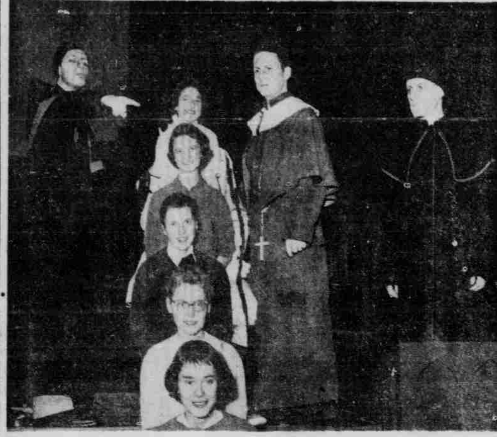
"HEADS WILL ROLL." roared the Star Chamberlain of the Student-Tried Bunal at the trial of five University co-heads. "Five down and five to go," he continued. (The Tried Bunal needs heads for its weekly ten-pin session, sponsored by Big Brother, at Catskill Heights, 4061 Preachers College.)