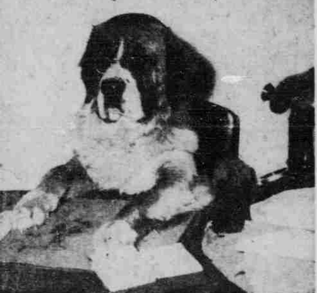
Wonder Dog on Trial