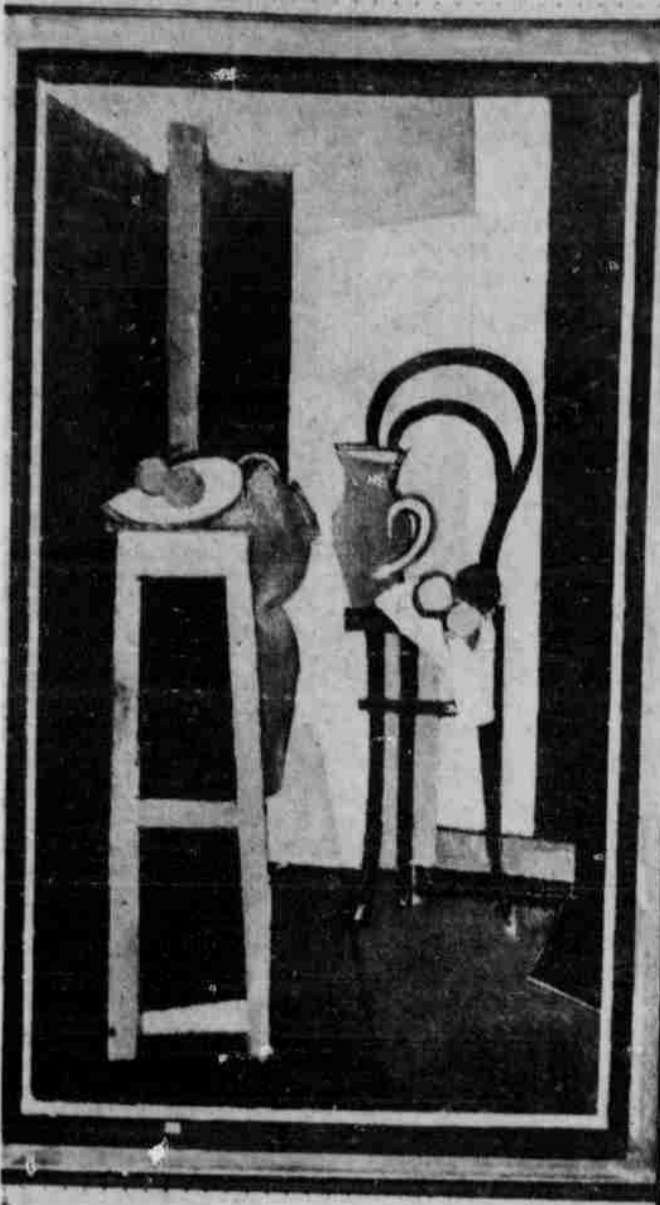
VERTICAL STILL LIFE portraits by Keith Vaughn are among the features of the Nebraska Art Association's annual exhibit at Morrill Hall.

The exhibit covers the last 100 years. It is interesting to see just how far we have come.