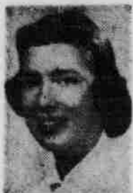
By Wendy Makepeace

November is a wonderful month of fashion. The trend in color is turning to the enchanting pastels—and the dress silhouette is being greatly influenced by the Empire line. Periwinkle blue, and seafoam green are two of the most charming holiday colors. Featured in the stylish empire waist line in sizes 7-15 for only 14.98, this dress is a must for all co-eds.