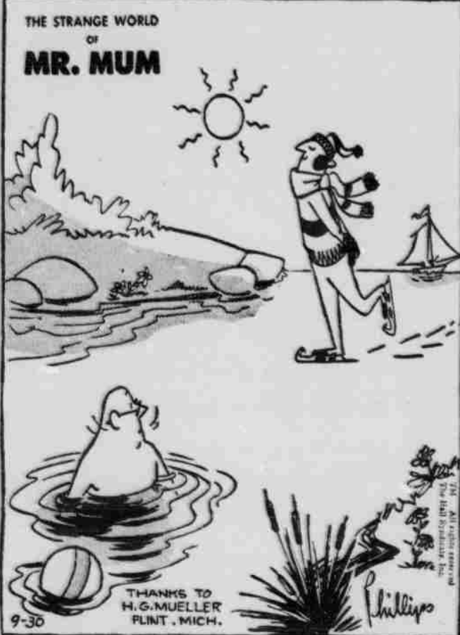
THE STRANGE WORLD OF MR. MUM