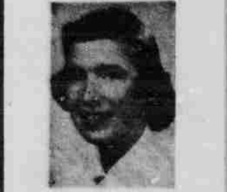
By Wendy Makepeace

A new novelty in sportswear is the skirt (a cross between a short and a skirt). These popular skirts come in a variety of plaids, stripes or just plain colors. All are permanently pleated and drip dry. Sizes include 10-16 for only 2.98. Gold's second floor sportswear has all the new fashions for you.