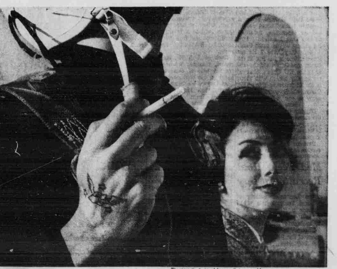
The cigarette designed for men that women like