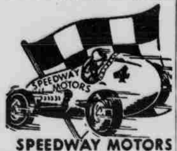
LINCOLN, NEBR. Speed Equipment Hollywood Mufflers