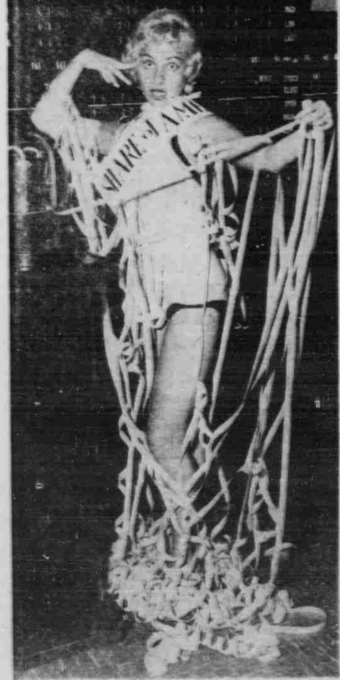
SHARE SCARE—A University Young Republican emphatically denies any present "economic crisis" as she talks before the group.