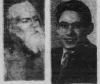
Then Now