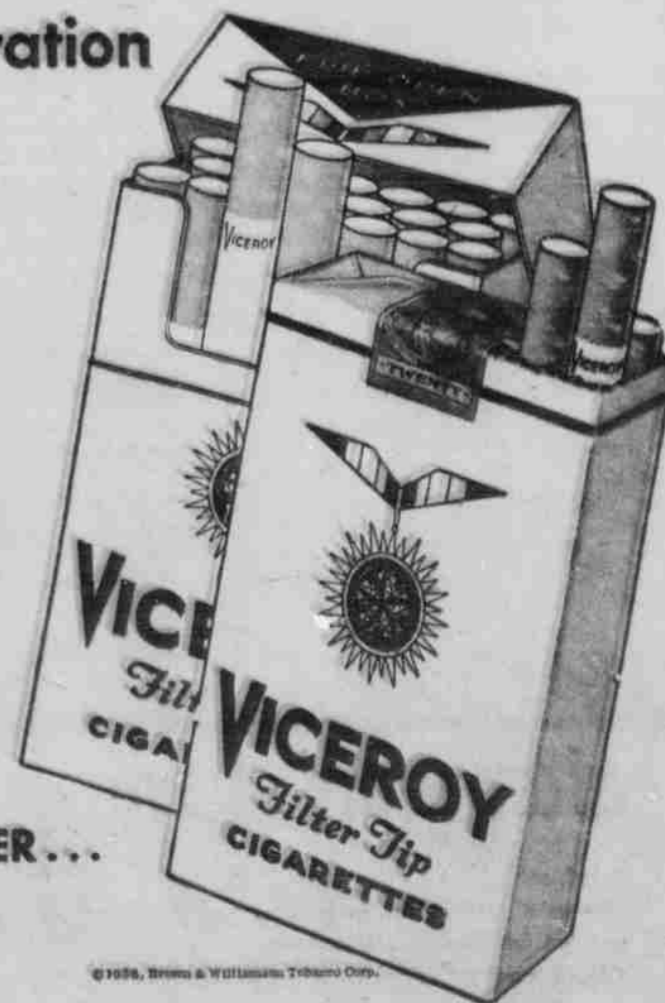
© 1958, Brown & Williamson Tobacco Corp.

VICEROY PURE, NATURAL FILTER... PURE, NATURAL TASTE