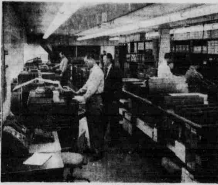
The purchasing department has a third typical office arrangement. The data processing office (formerly IBM) is located on the top floor.