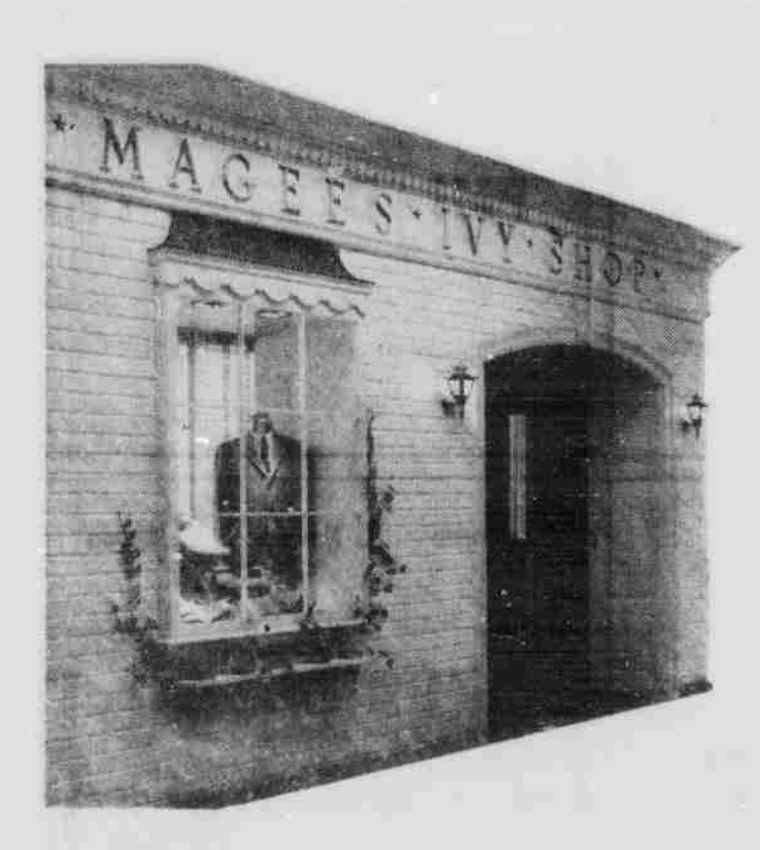
MEET OUR MEN'S COLLEGE BOARD '57

These are the men to ask about what's new at Magee's, in Ivy Suits, Sportswear and Furnishings . . . they'll help you choose a completely integrated by Wardrobe from Magee's authentic Ivy Fashions.