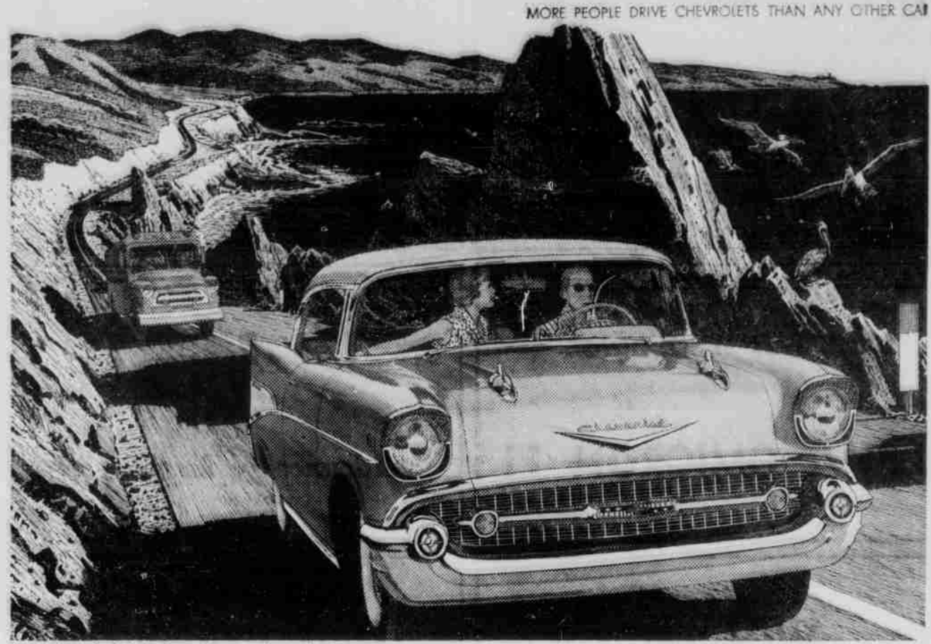
New Chevrolet Bel Air Sport Coupe with spunk to sparel