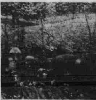
Red Fox Habitat Group

The Hall of Nebraska Wildlife is one of many outstanding and colorful exhibits in the Museum.