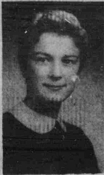
Nebraska Photo LINDA BUTHMAN

Students who plan to return later than the regular closing hours on Sunday should obtain special permission from their house-mother. All houses will be open by 3 p.m. Sunday unless other arrangements are made in individual houses.