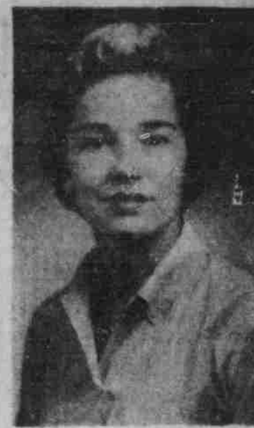
Nebraska Photo DIANE PEDERSON