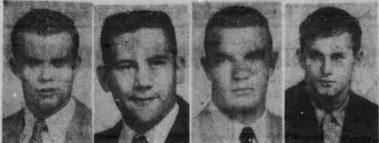
Courtesy Lincoln Journal Berguin Courtesy Lincoln Star Fleming Courtesy Lincoln Star Murphy Courtesy Lincoln Star Greenlaw

deal as an offensive end and is Baylor's leading pass receiver.