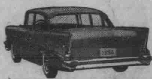
The new Bel Air 4-Door Sedan—one of 20 striking new Chevies.

*270-h.p. engine also available at extra cost. Also Ramjet fuel injection engines with up to 285 h.p. in Corvette and passenger car models.